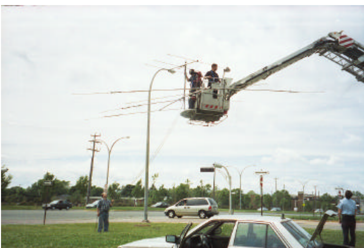
Now this is how you put up an antenna!

In the end, we made 1119 QSOs for a total of 3158 points. Thanks to all the hams who came by to help: VA2SH,