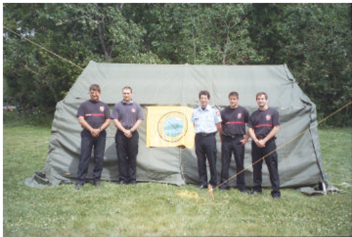
Our helpers from the Pointe-Claire Fire Department