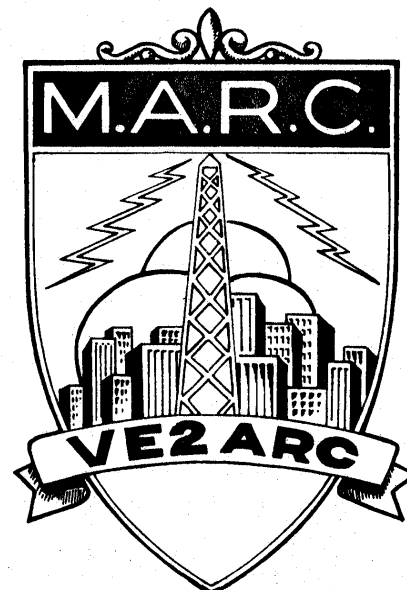
An Montreal Amateur Radio Club logo from 1972.